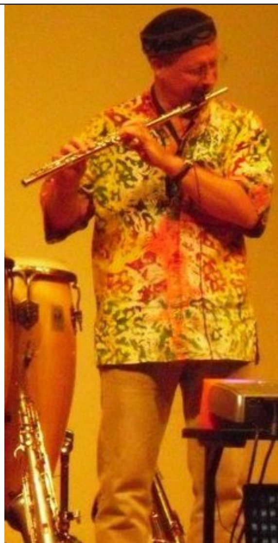
Photo: on stage at the Ghanaian embassy